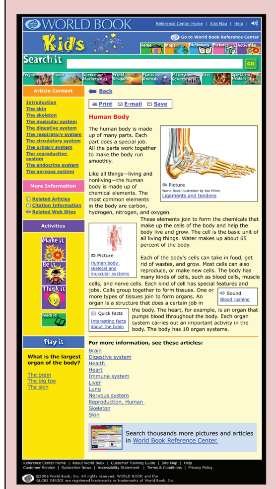
Colorful illustrations, diagrams, and maps enrich thousands of articles.